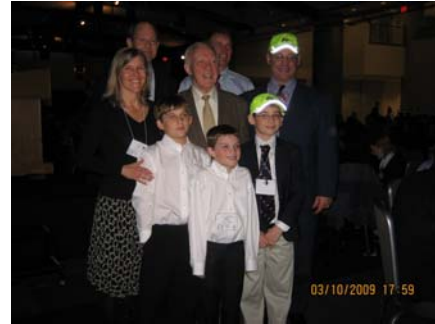
The Congressman surrounded by proud Bear Creek Representatives